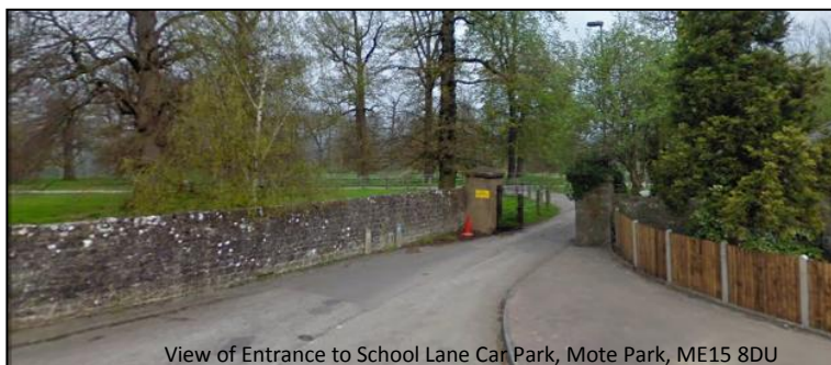
View of Entrance to School Lane Car Park, Mote Park, ME15 8DU

The walk is approximately a mile (the dogs run much further than that!) and will last about one hour. There is a gentle ascent for about 500m towards the end. It is suitable for powered wheelchairs and mobility scooters during the summer months, when not muddy, though there is some uneven ground. The walk passes by a lake so be prepared for a wet dog!